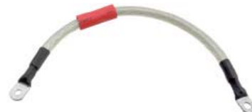
95A15-13C04-CL Cable Wire