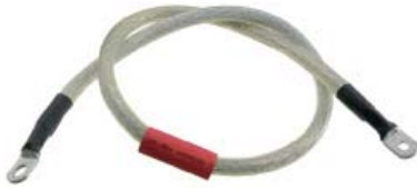
95A15-30C04-CL Cable Wire