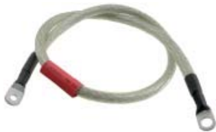
95B13-30C04-CL Cable Wire