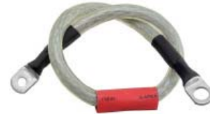
95B13-17C04-CL Cable Wire