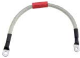
95A15-14C04-CL Cable Wire