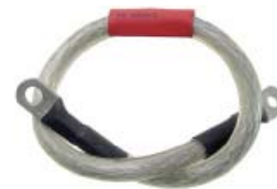
95A15-17C04-CL Cable Wire