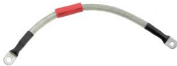
95A15-12C04-CL Cable Wire