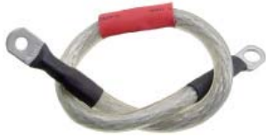
95B13-16C04-CL Cable Wire