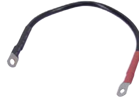
95A15-16C04-BK Cable Wire