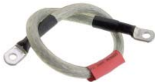
95A15-16C04-CL Cable Wire