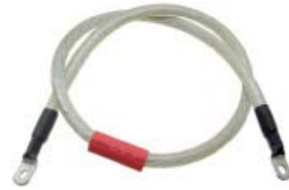
95A15-33C04-CL Cable Wire