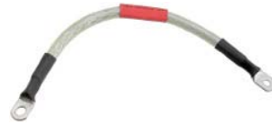
95A15-11C04-CL Cable Wire