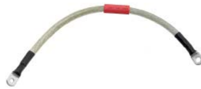
95A15-15C04-CL Cable Wire